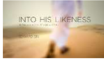
Into His Likeness – Be Transformed as a Disciple of Christ

St. Joseph Family Care Program – Open Enrollment for affordable health care to families. Provides health care for $60/family or $240/individual per year. For information and sign up online go to stjosephcare.org .