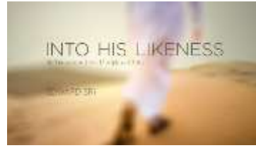
Into His Likeness – Be Transformed as a Disciple of Christ

St. Joseph Family Care Program – Open Enrollment for affordable health care to families. Provides health care for $60/family or $240/individual per year. For information and sign up online go to stjosephcare.org .