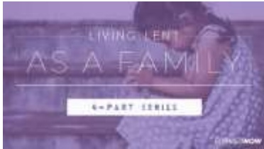
Living Lent as a Family-4pt Series

FORMED for Lent – Try the following programs for Lent on Formed.org. Every member of our Community has a subscription to this awesome Catholic Program. This is just a sampling – there is something for everyone.