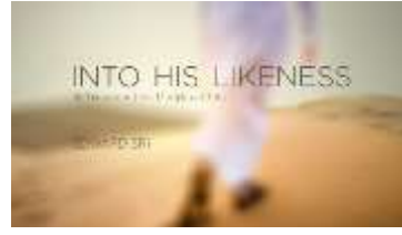
Into His Likeness – Be Transformed as a Disciple of Christ

St. Joseph Family Care Program – Open Enrollment for affordable health care to families. Provides health care for $60/family or $240/individual per year. For information and sign up online go to stjosephcare.org .