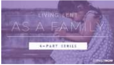
Living Lent as a Family-4pt Series

FORMED for Lent – Try the following programs for Lent on Formed.org. Every member of our Community has a subscription to this awesome Catholic Program. This is just a sampling – there is something for everyone.