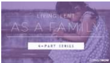
Living Lent as a Family-4pt Series

FORMED for Lent – try the following programs for Lent on Formed.org. Every member of our Community has a subscription to this awesome Catholic Program. This is just a sampling – there is something for everyone.