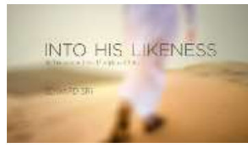
Into His Likeness – Be Transformed as a Disciple of Christ