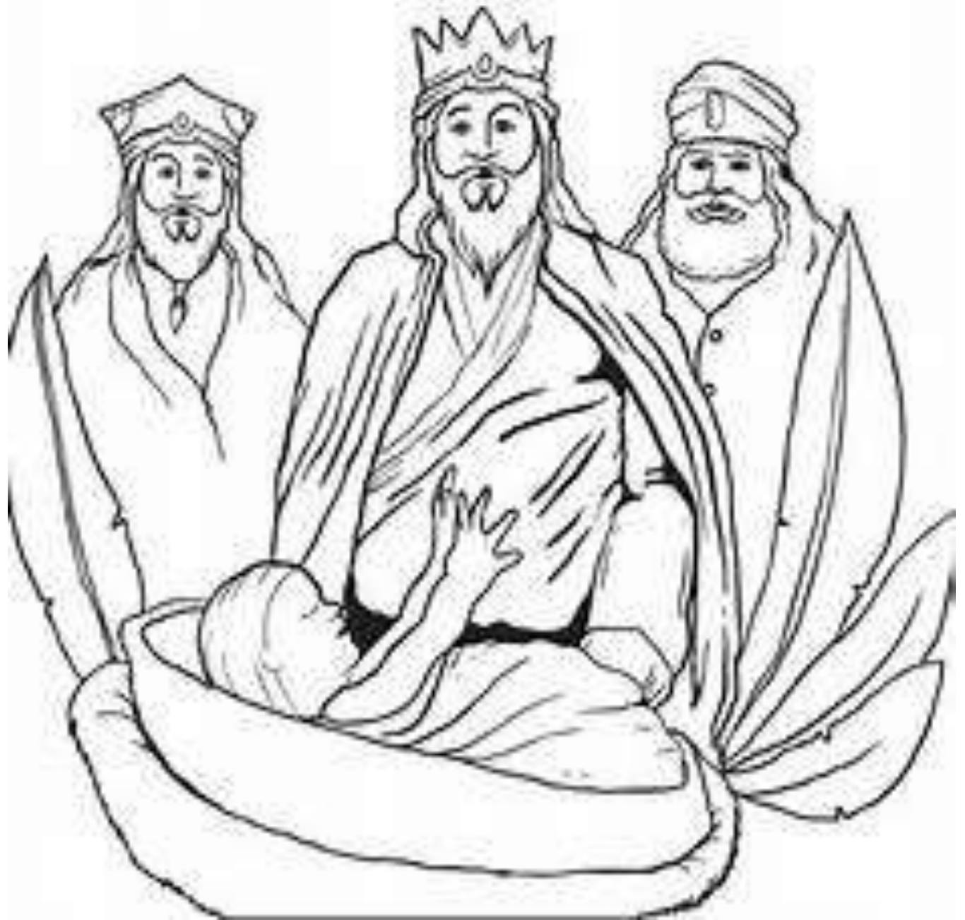
The Epiphany of the Lord