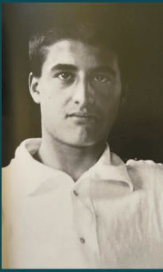
Pier (PEE-air) Giorgio (GEORGE-o) Frassati (Fra-SAH-tee)