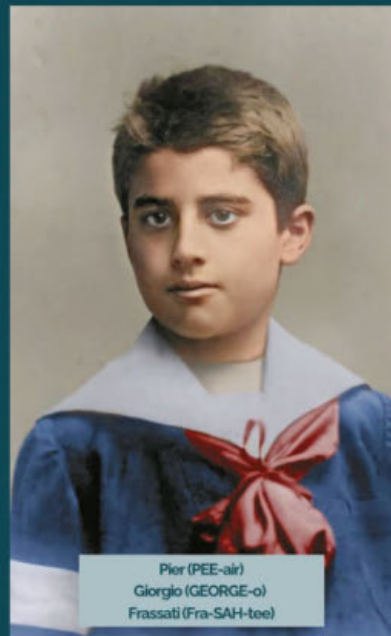
Pier (PEE-air) Giorgio (GEORGE-o) Frassati (Fra-SAH-tee)