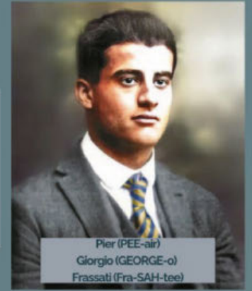
Pier (PEE-air) Giorgio (GEORGE-o) Frassati (Fra-SAH-tee)

Frassati Challenge: Instead of going out to eat a meal with a friend, cook it yourselves and give the cost difference to a charity or the church.